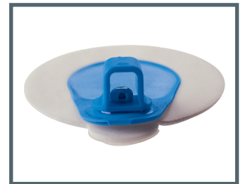
A = 4 mm fitting